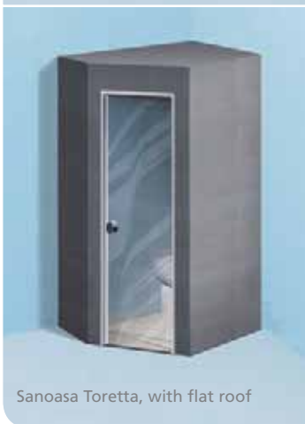
Sanoasa Toretta, with flat roof