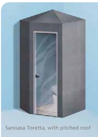
Sanoasa Toretta, with pitched roof