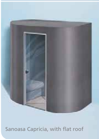
Sanoasa Capricia, with flat roof