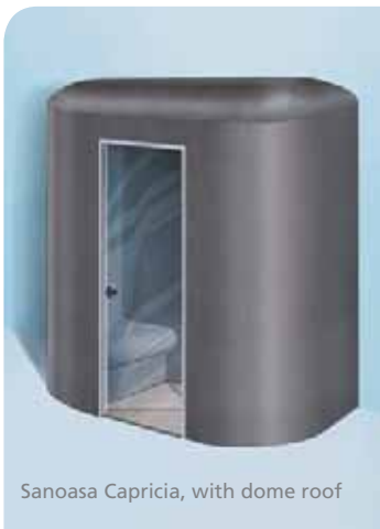
Sanoasa Capricia, with dome roof