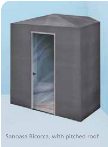
Sanoasa Bicocca, with pitched roof