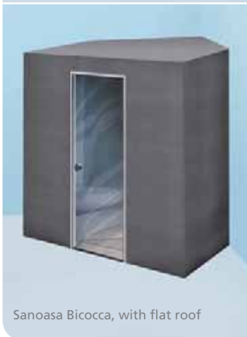
Sanoasa Bicocca, with flat roof