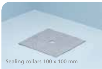
Sealing collars 100 x 100 mm