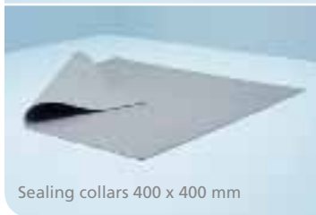
Sealing collars 400 x 400 mm