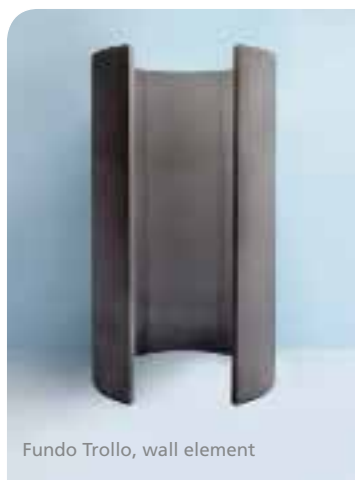
Fundo Trollo, wall element