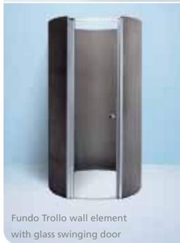
Fundo Trollo wall element with glass swinging door